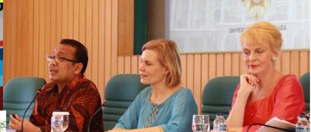
Sustainable Cities and Waste Management