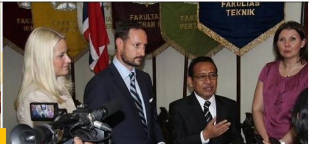
Climate Change: In Search of Balance