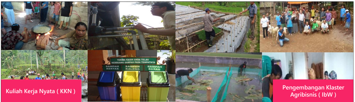
Kuliah Kerja Nyata ( KKN )