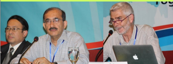
Sustainable Peat Management: With Industry Locally Rooted, Globally Respected